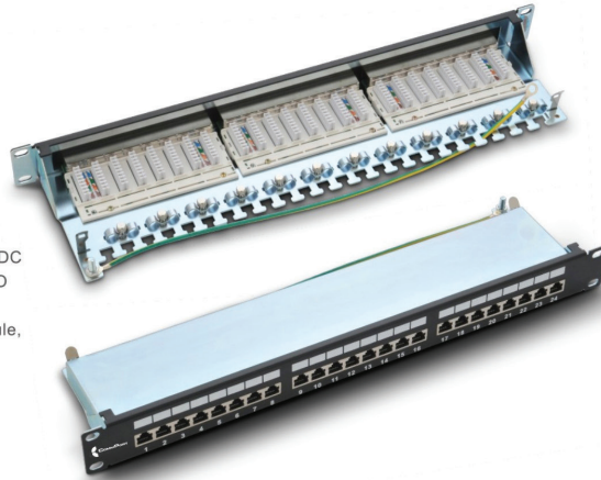
CAT 6 shielded patch panel.