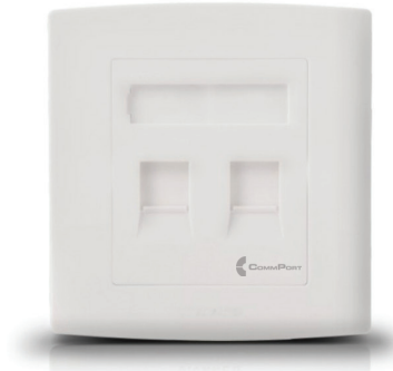
Outlet Plate - Dual Port