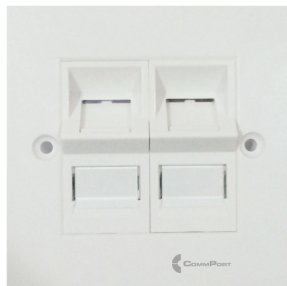
Angled Outlet Plate