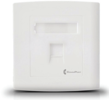
Outlet Plate - Single Port