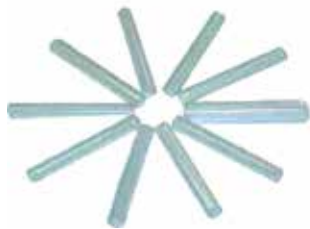
Ribbon type (8/12F) L40mm