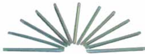
Simplex type L40/45/60mm Dia.2.0/2.5/3.0mm